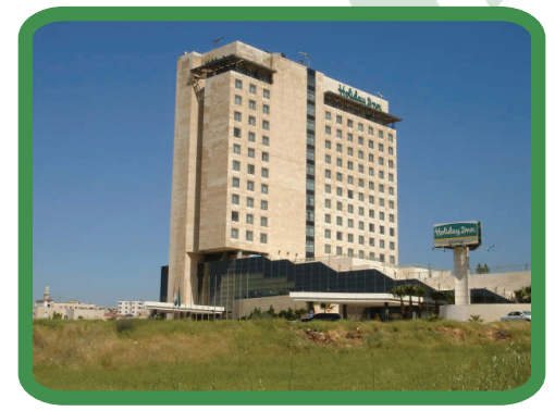
Holiday Inn Hotel - Amman